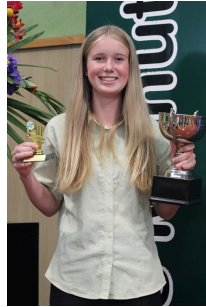
Paton Family Cup Top All Round Year 7&8 Student