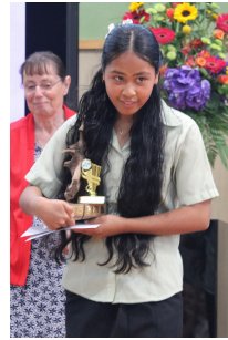
Wolfsbauer Attitude Award For Excellence in Attitude