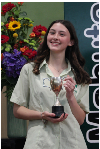
The Principal's Cup Top Year 9&10 student for overall Academic Excellence