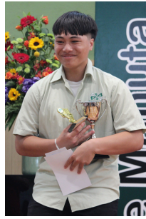
Mary Nelson Cup For outstanding citizenship and embodying the school values