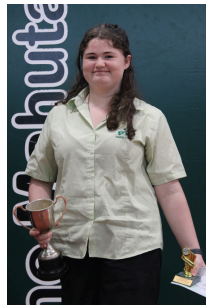
The Hema Cup For reflecting the school motto across the four school values