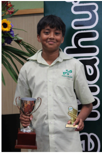
Betty Family Cup Top Year 7&8 Academic student