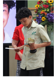
Rowan Hucker Cup For the top Year 7&8 student in PE