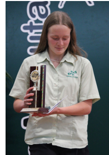
The Douglas Hughes Memorial Trophy For Whaanau loyalty