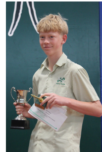
The Tim Foy Cup For a Year 10 student for industry, co- operation and service