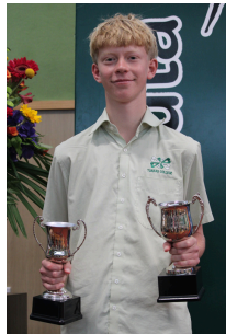
Chris Betty Cup Top All Round Year 9&10 student across the four kete